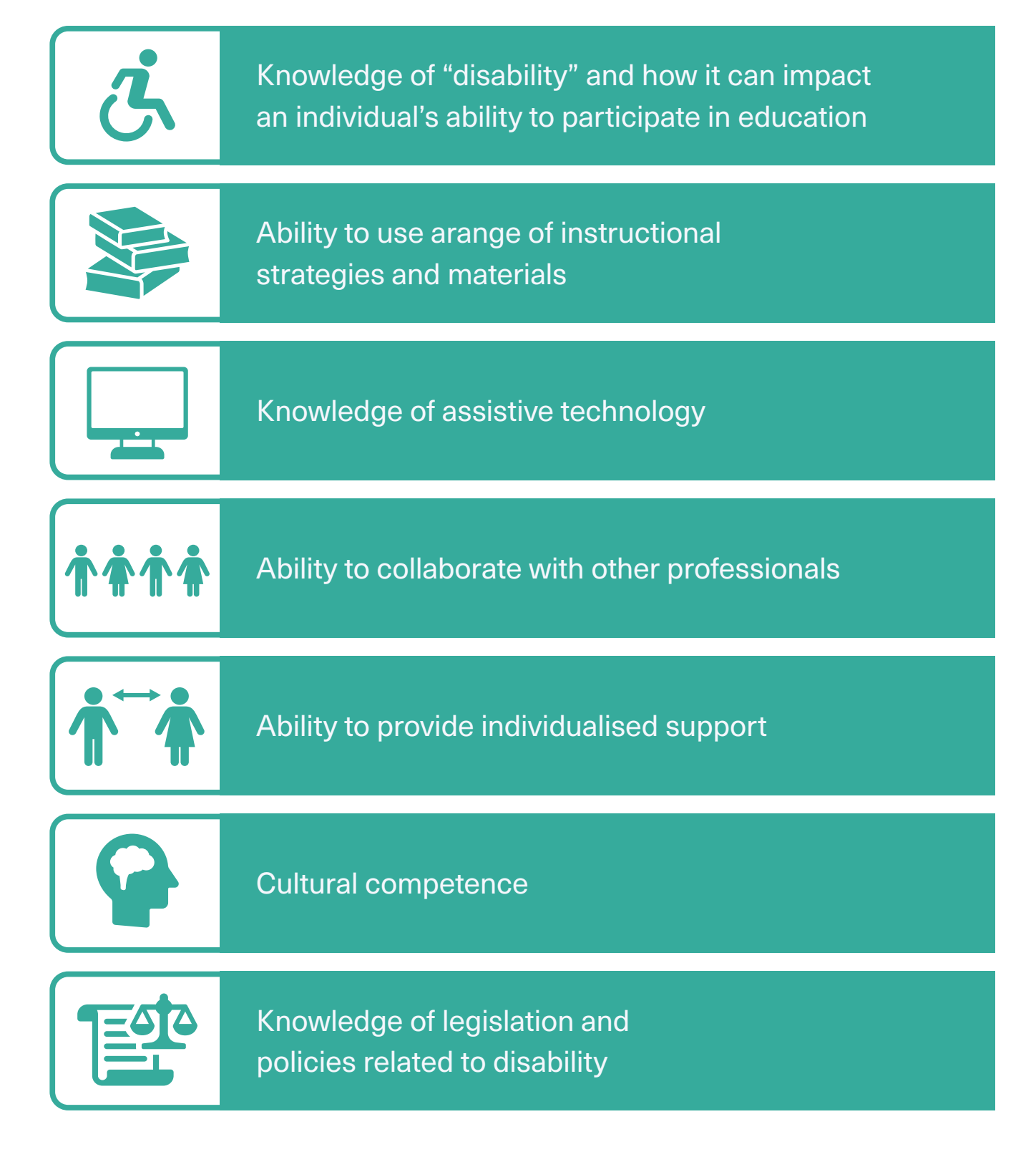
Figure 3 - Some of the competences to help assist adult educators with teaching persons with disabilities.

In conclusion, adult educators must possess competences that enable them to support individuals with disabilities effectively. By understanding disabilities, adapting teaching methods, communicating clearly, and demonstrating empathy, educators foster inclusive learning environments where individuals can overcome obstacles and reach their full potential. Collaboration and resourcefulness further enhance their ability to create inclusive classrooms.